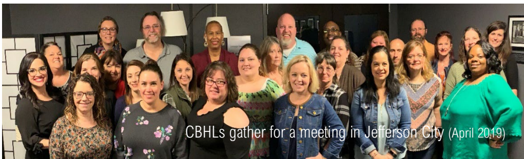
CBHLs gather for a meeting in Jefferson City (April 2019)